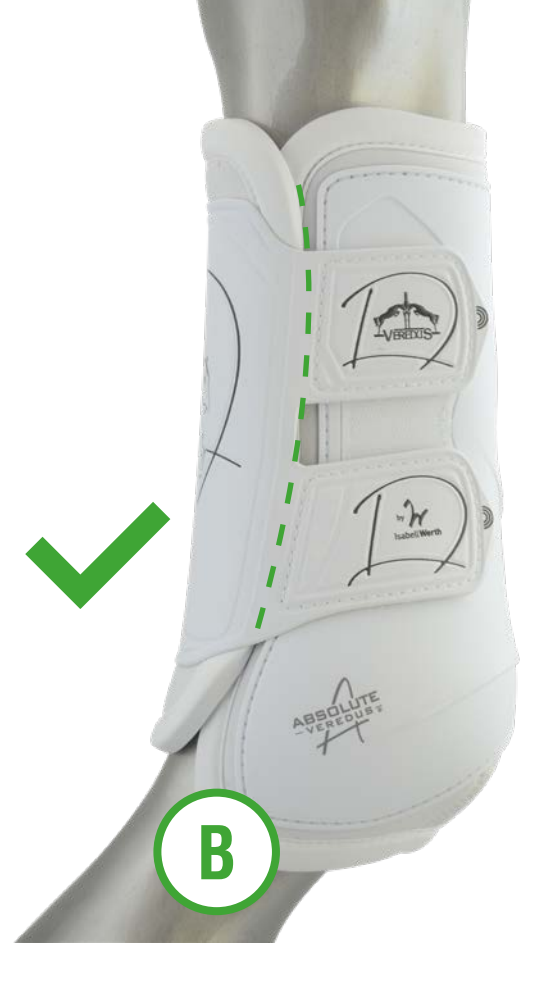
AD size correct overlapping