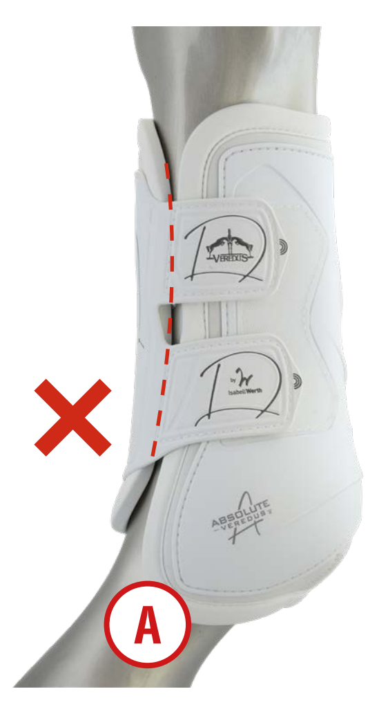
AD size too small