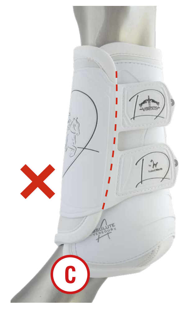
AD size too big. Excessive overlapping